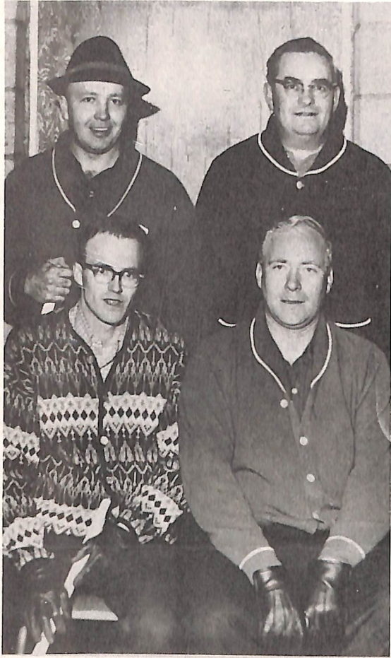
Kirk Event Winners