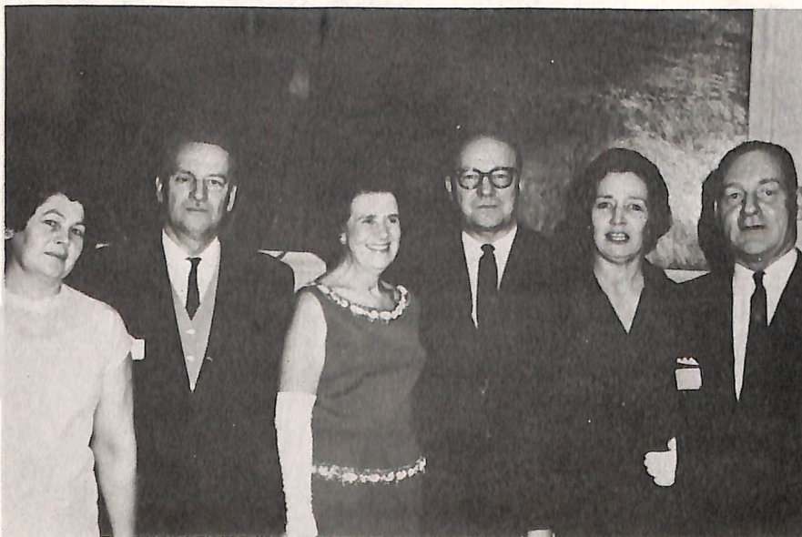
1937 Degree Grads and their wives enjoyed themselves at the banquet and dance