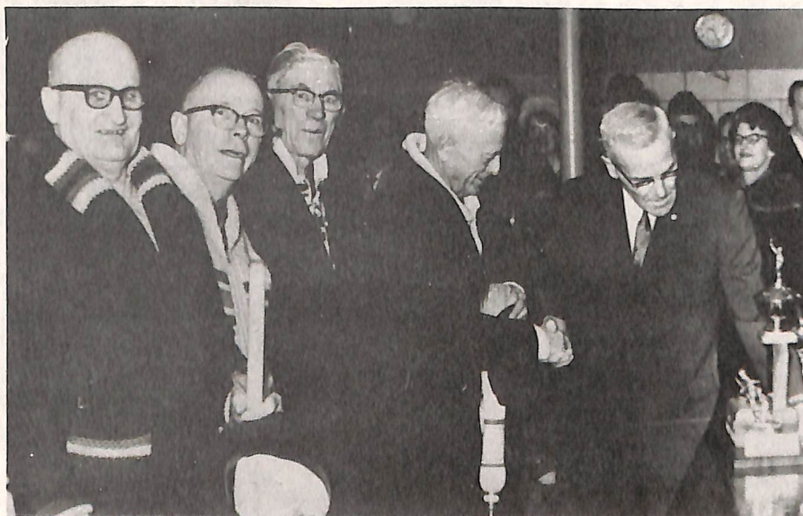
Hutcheon Trophy Winners