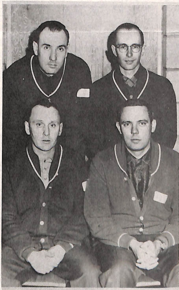
Rutherford Event Winners