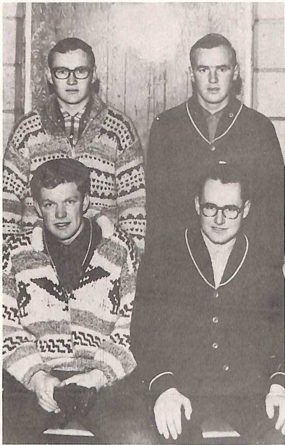
Skelly Event Winners