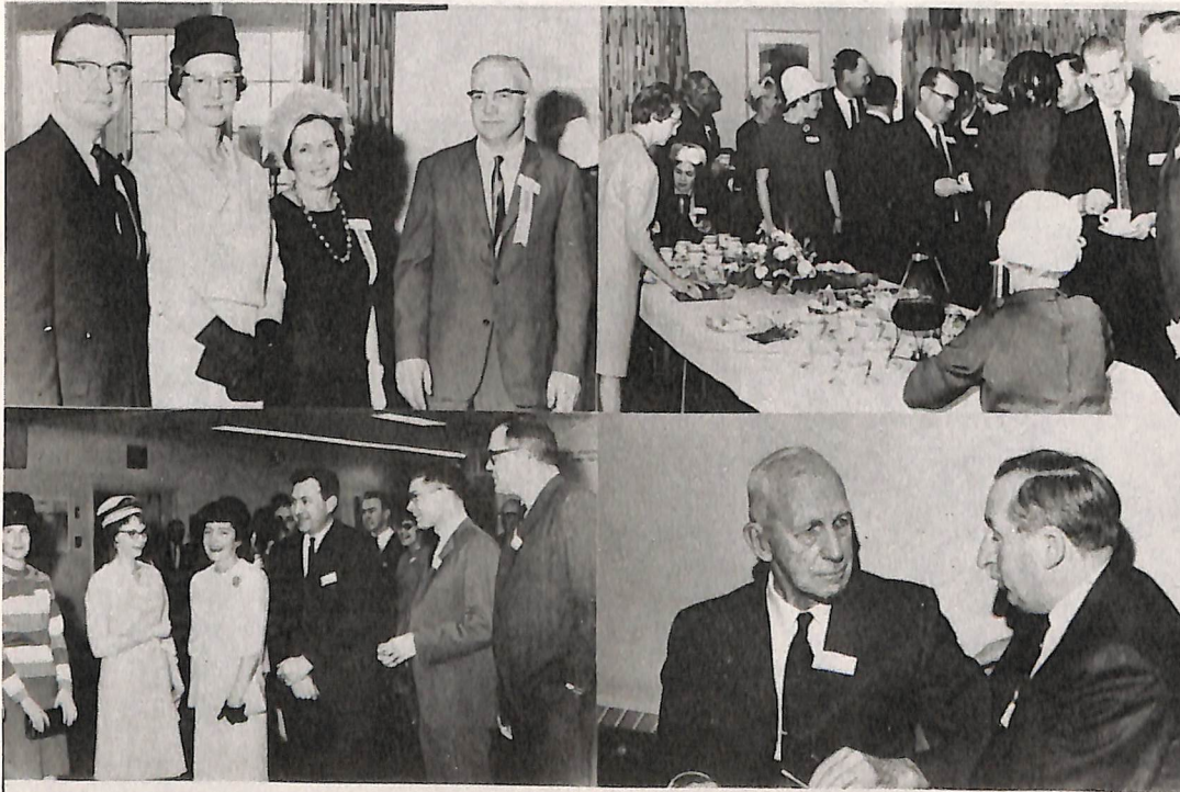
Greeting and meeting of the Agros at the Sunday Tea